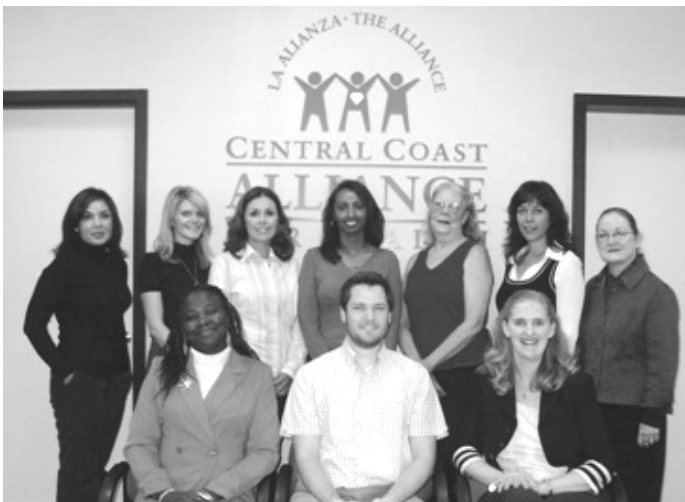
The Alliance Provider Services Department

The Alliance would like to extend a big THANK YOU to all of our providers. Your continued efforts and commitment to provide quality care are greatly appreciated. We wouldn't be here without you! May this holiday season bring you good health, happiness and time to enjoy family and friends.